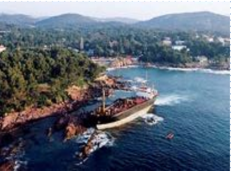
HUMAN TRAFFICKING / SMUGGLING