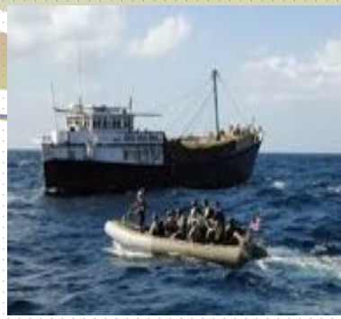
PIRACY / OIL THEFT