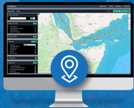
Advanced mapping + vessel intercept (coordination-oriented)