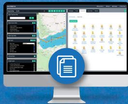
File exchange, documents and forms (coordination-oriented)