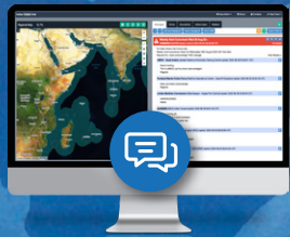
Multilingual messaging, chat, alerts (communication-oriented)