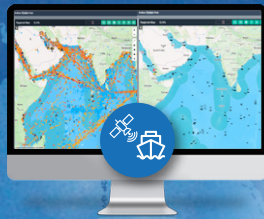
Satellite-based Data Feeds (coordination-oriented)