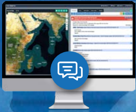
Multilingual messaging, chat, alerts (communication-oriented)