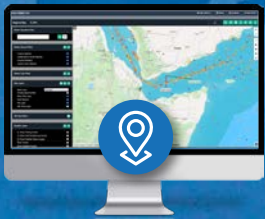
Advanced mapping + vessel intercept (coordination-oriented)