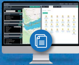
File exchange, documents and forms (coordination-oriented)