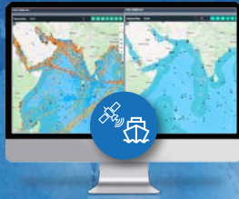
Satellite-based Data Feeds (coordination-oriented)